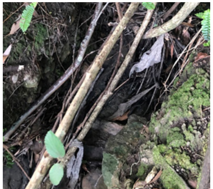
Photo 9 Illegal private sewer to stormwater connection – toilet paper visible