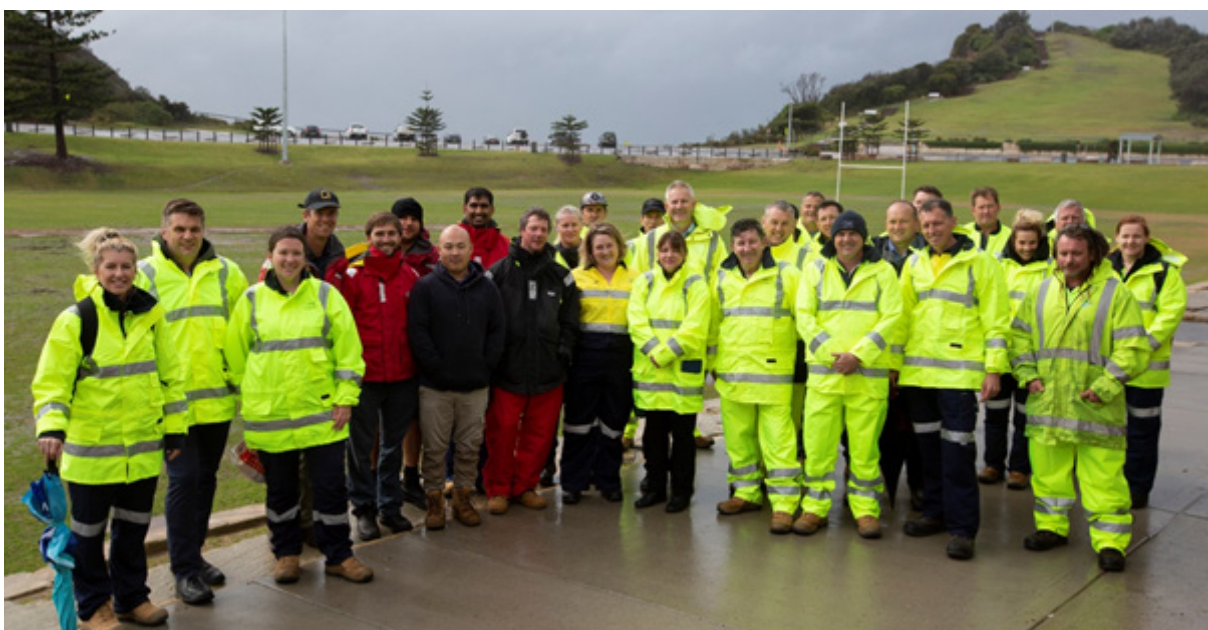
Photo 1: Wet weather sampling day for staff from Central Coast Council and the NSW Government's Department of Planning, Industry and Environment.

This report provides an update on the sewerage remediation progress and works program in direct response to the water quality investigations, addressing the pollution risks to swim safety and ecological health.