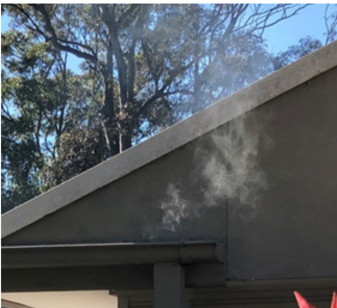
Photo 8: Illegal stormwater to sewer connection detected during smoke testing