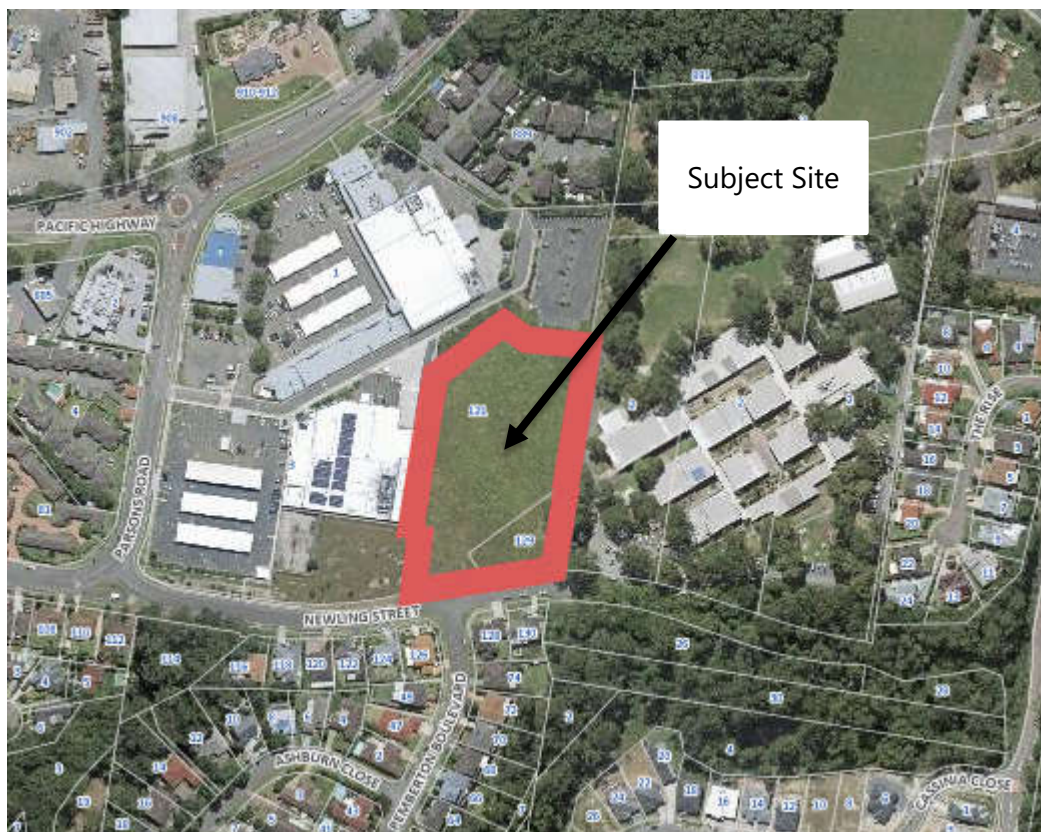
Figure 1: The Subject Site Aerial – Planning Proposal Area bounded in Red

The land subject to the rezoning request (see Figure 1) comprises the whole of proposed lot 2 under the consolidation and re-subdivision of Lot 122 DP 1218619 and Lot 4 DP 660988 (DA 58001/2020 of 21/7/20) and has a total area of 11,710 m 2 .