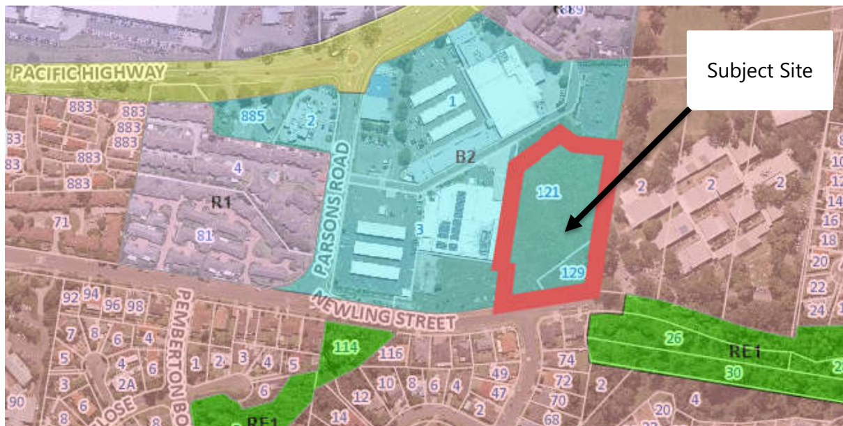
Figure 2: Site Aerial showing Existing Zones

The land is currently zoned B2 Local Centre (see Figure 2) under the Gosford Local Environmental Plan 2014 (GLEP 2014), with no minimum area for subdivision. The draft Central Coast Local Environmental Plan (dCCLEP) proposes to retain the current B2 zoning of the land.