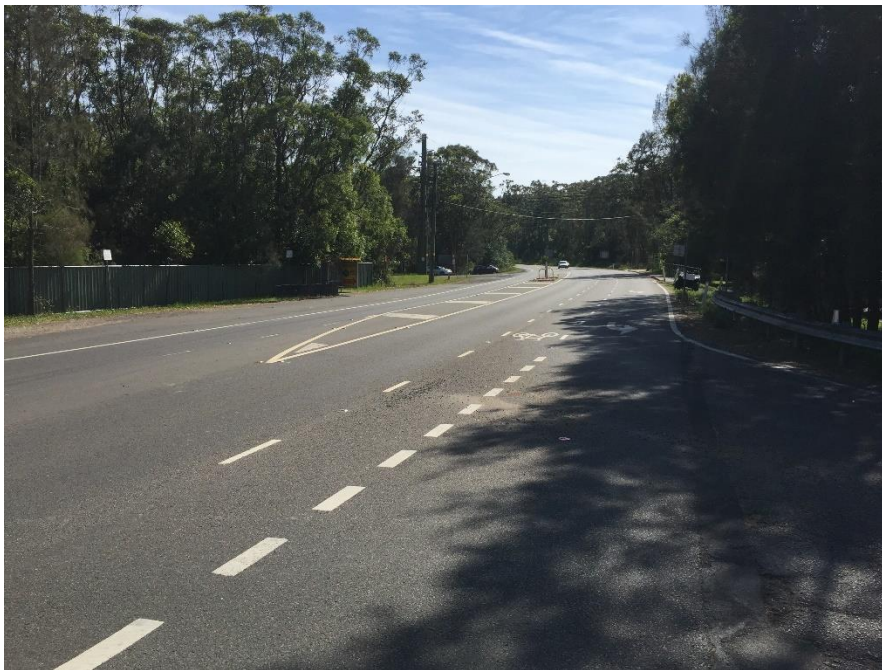
Photo 2 – View to right for drivers exiting Wards Hill Road into Empire Bay Drive