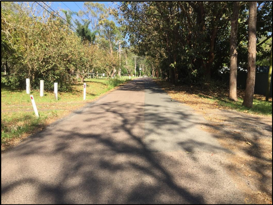
Photo 4 – View along Pomona Road showing typical cross section. Site access is to right hand side of the photo.