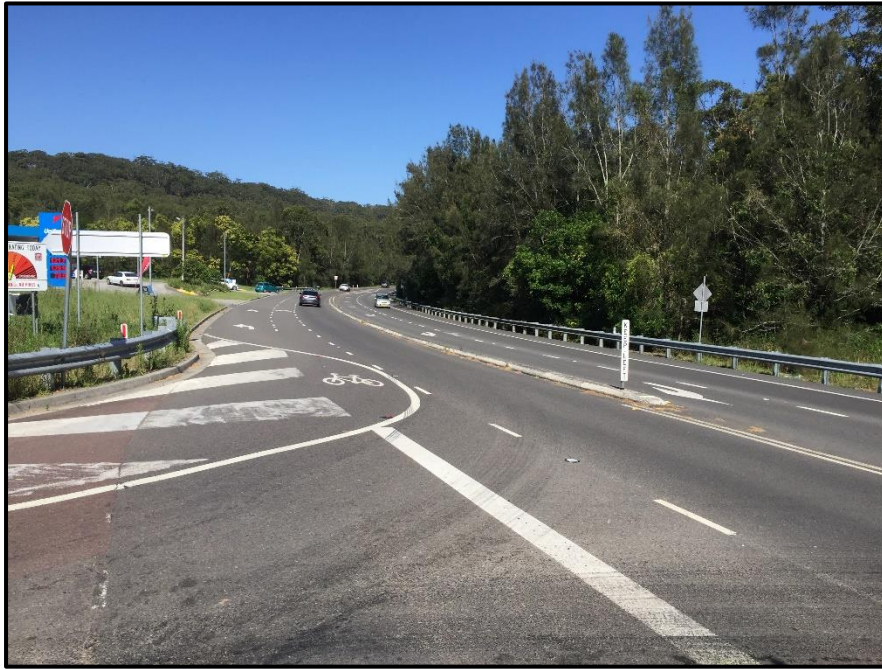
Photo 1 – View to left for drivers exiting Wards Hill Road into Empire Bay Drive