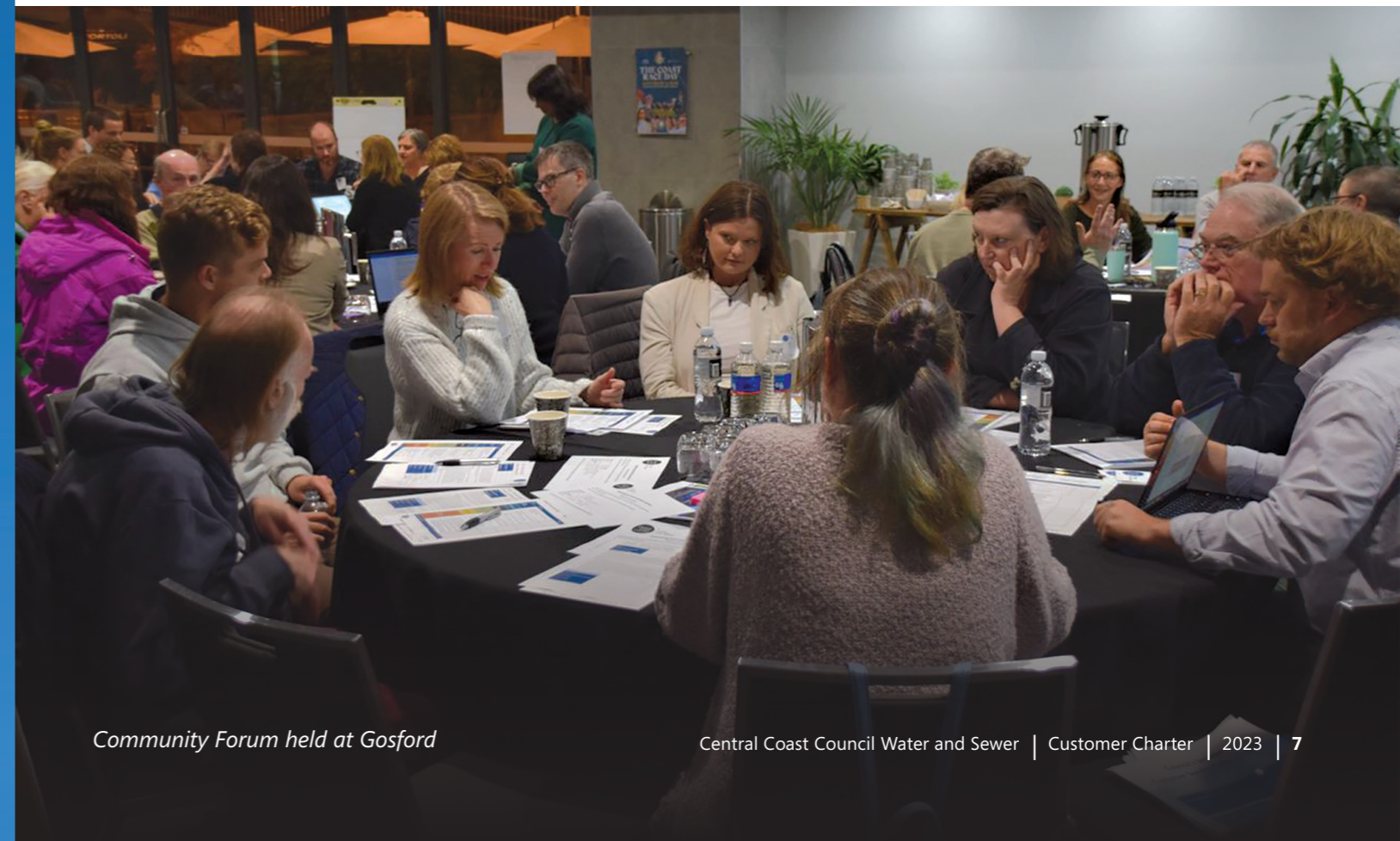
Community Forum held at Gosford