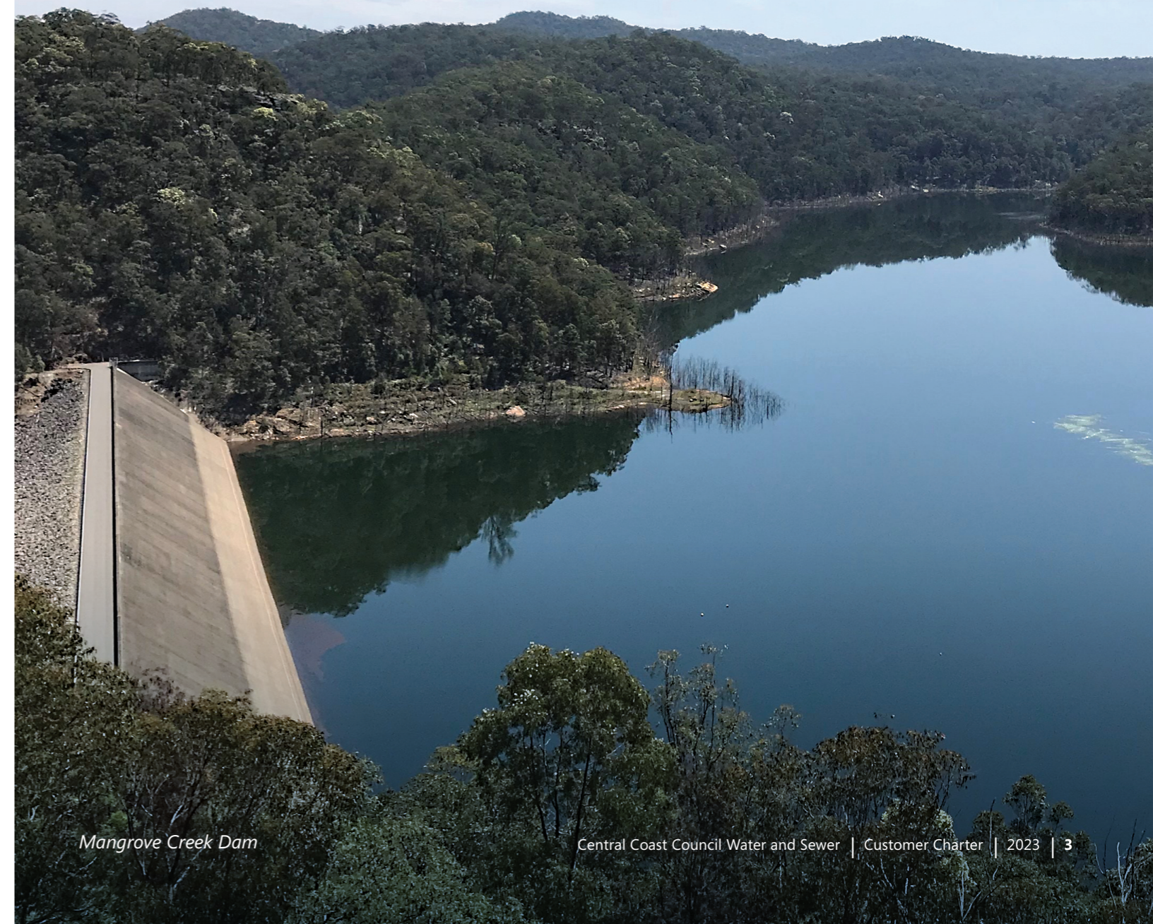
Mangrove Creek Dam